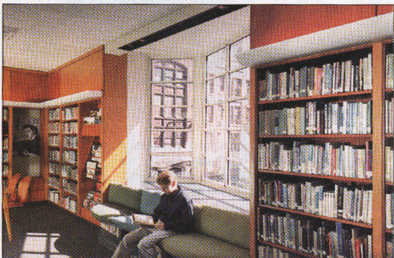
Bay window reading area